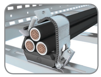
4. Pull cleat arm over the cables.