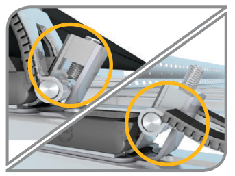
5. Adjust the hinge using a 4mm allen key to suit the cable.

2. Insert base booster if required and secure to mounting surface using specified torque rating 8N/m.