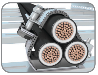
6. Use supplied mouthpiece fittings to tighten down to no more than 8N/m with 19mm spanner.